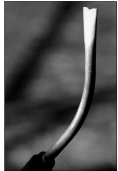
Figure 4.—A new tip can be constructed using a \frac{3}{8} -inch pipe nipple and coupler. Note the end of the nipple has been smashed flat, creating an opening of about \frac{3}{8} inch for the flame. This allows the gas to burn cool with no aeration. Remove the end of the weed burner and attach the new tip to the end of the torch.

Flame clipping can be done in the milking parlor or in the larger feeding area. It takes only a few seconds per cow and should be done every 4 to 5 weeks.