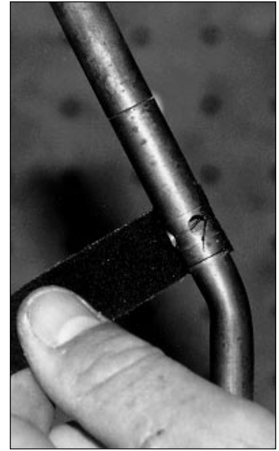
Figure 3.—Taping the tip excludes air and maintains a cooler flame.