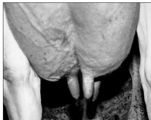
Figure 1b.—An udder after hair removal.