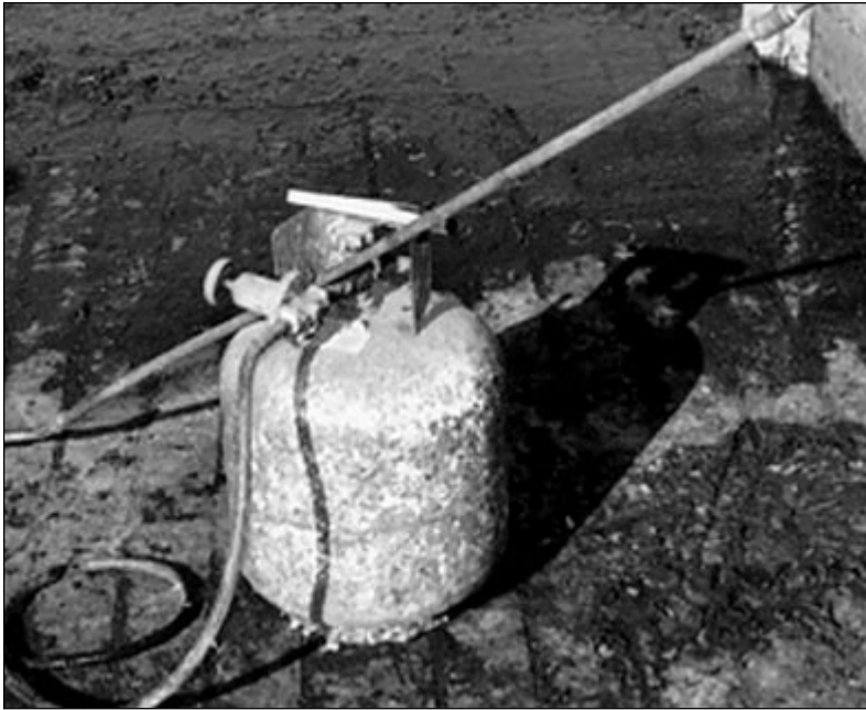
Figure 2.—A commercially available weed-burning torch can be modified to flame-clip udders. Either flatten and tape the tip (Figure 3) or construct your own tip (Figure 4).