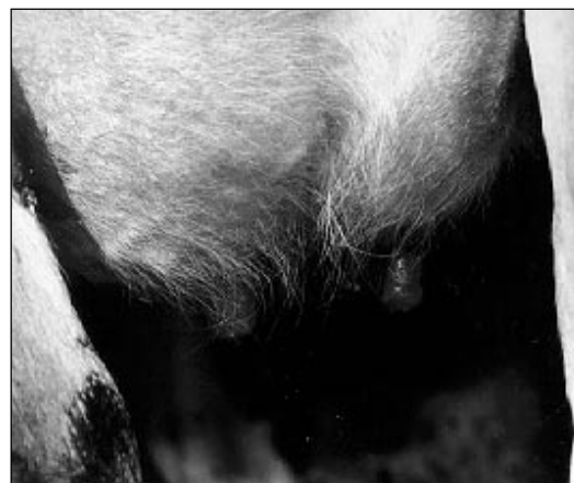
Figure 1a.—An udder before hair removal.

Milking cows with clean udders is a goal of most programs, but it can be a challenge to keep udders clean during winter, when barnyards are wet and hair on udders grows quickly. For many years, clipping with electric clippers has been a way to maintain clean udders, but this practice is very time-consuming and difficult in some herds. Moreover, most cows are not accustomed to the noise of electric clippers and may be nervous when the clippers are running, thus posing a hazard to the person clipping.